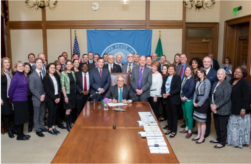
SB 5825 – Tolling SR 167 / Gateway Acceleration Bill Signing