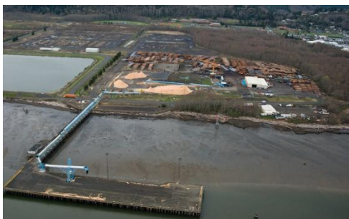
Port of Grays Harbor Marine Terminal 3 is the 150-acre site RailAmerica is considering as a potential bulk cargo export terminal. One of the commodities that could be exported through the potential facility is coal. As shown, a portion of the site is currently leased by Willis Enterprises for wood chip processing and shipments.

RailAmerica, the parent company of Puget Sound and Pacific Railroad, has begun a public discussion about the potential for a bulk facility at the Port of