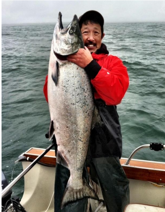
Boaters of all sizes find the facilities at the Westport Marina the perfect base for the summer fishing season. Clockwise from top left: The Tequila Too returns after a successful day of charter fishing. A charter fisherman proudly displays a 37-lb salmon caught off Westport. Electrical hook ups are available on most floats.

Sport salmon season peaked at the Westport Marina this month with staff working to accommodate all the visiting boaters looking for moorage.