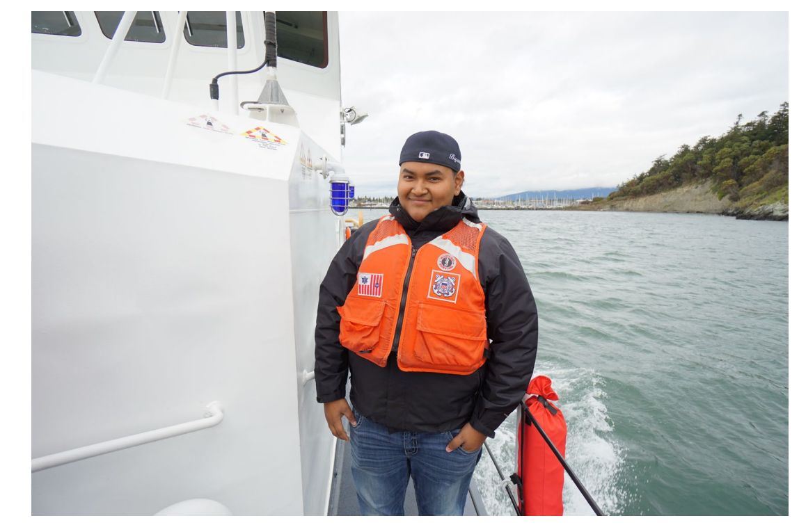
NCTA Student Onboard USCGC Sea Lion