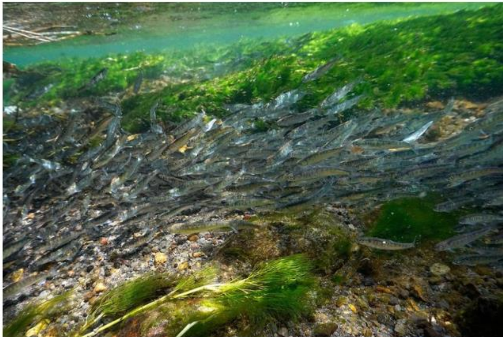
Juvenile salmon spend their first few months in saltwater growing in nearshore habitat, increasing their odds of