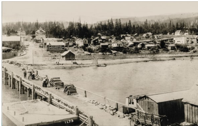
Stevenson Waterfront, early 1900's