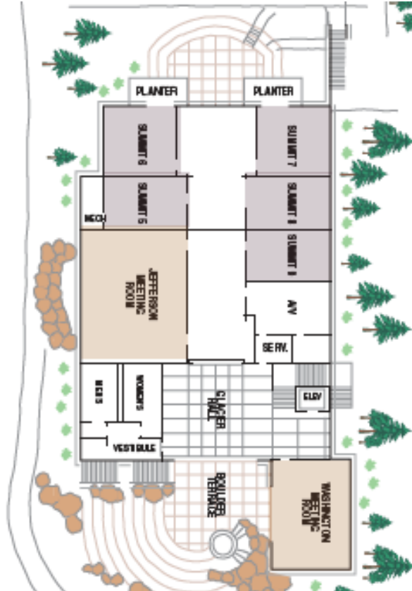
Lower Level Conference Floor Plan