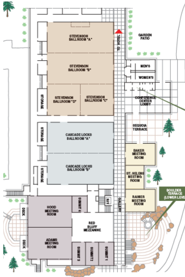
Main Level Conference Floor Plan